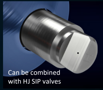
Can be combined with HJ SIP valves

UPGRADE MECHANICAL LUBRICATORS TO ELECTRONIC LOAD DEPENDENT LUBRICATION